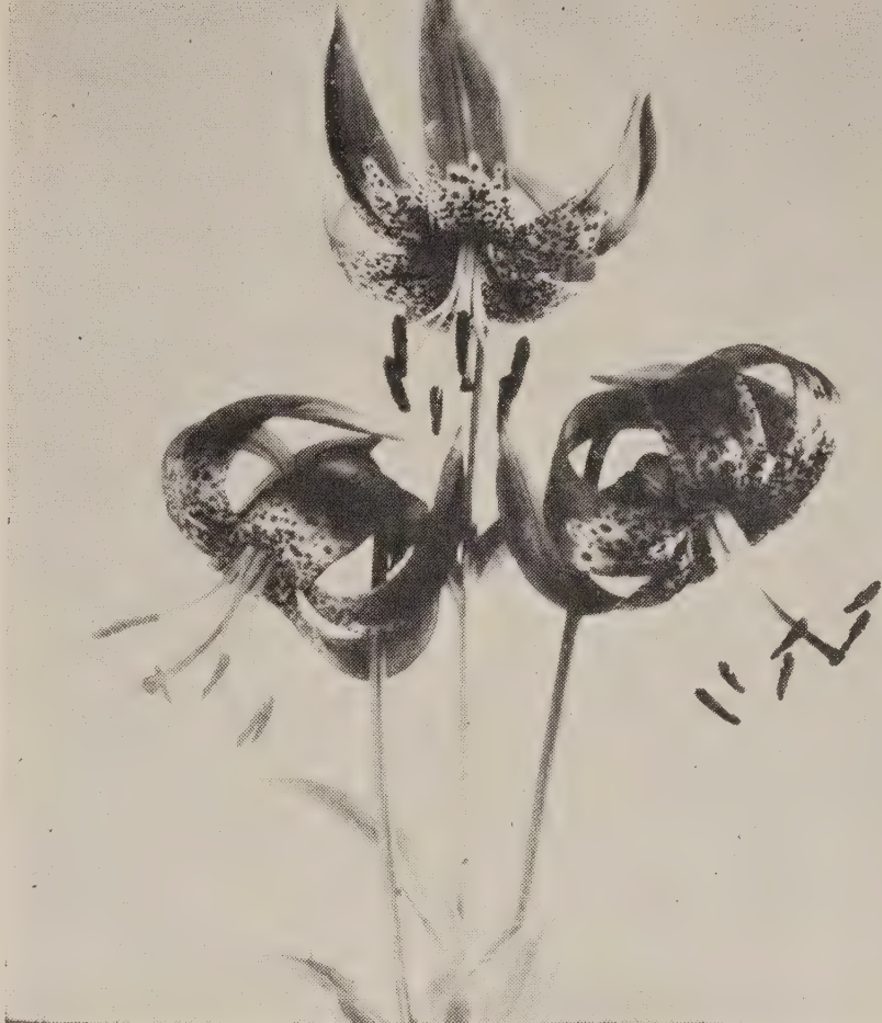
THE SUNSET LILY

PRINCEPS, G. C. Creelman-630 —The true variety. One of the finest of the Regal x Sargentiae hybrids. Extraordinary heads with up to 30 trumpet shaped blooms, white, lemon-yellow center, shaded brownish lavender exterior. Late July. Sun or shade. Scarce. Each $3.10.